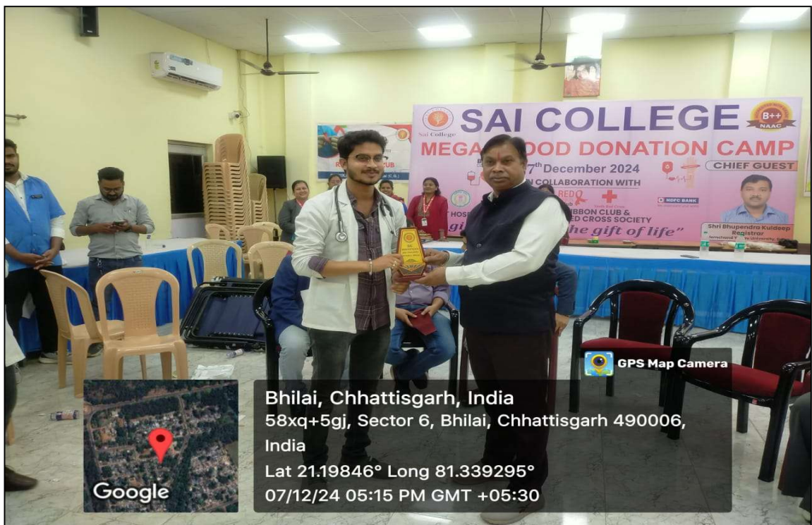
GPS Map Camera