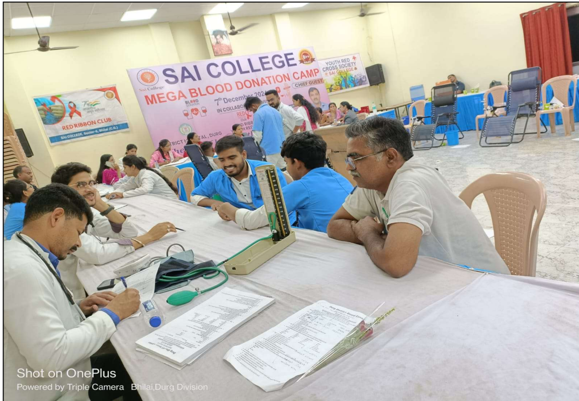
Shot on OnePlus Powered by Triple Camera Bhilai,Durg Division